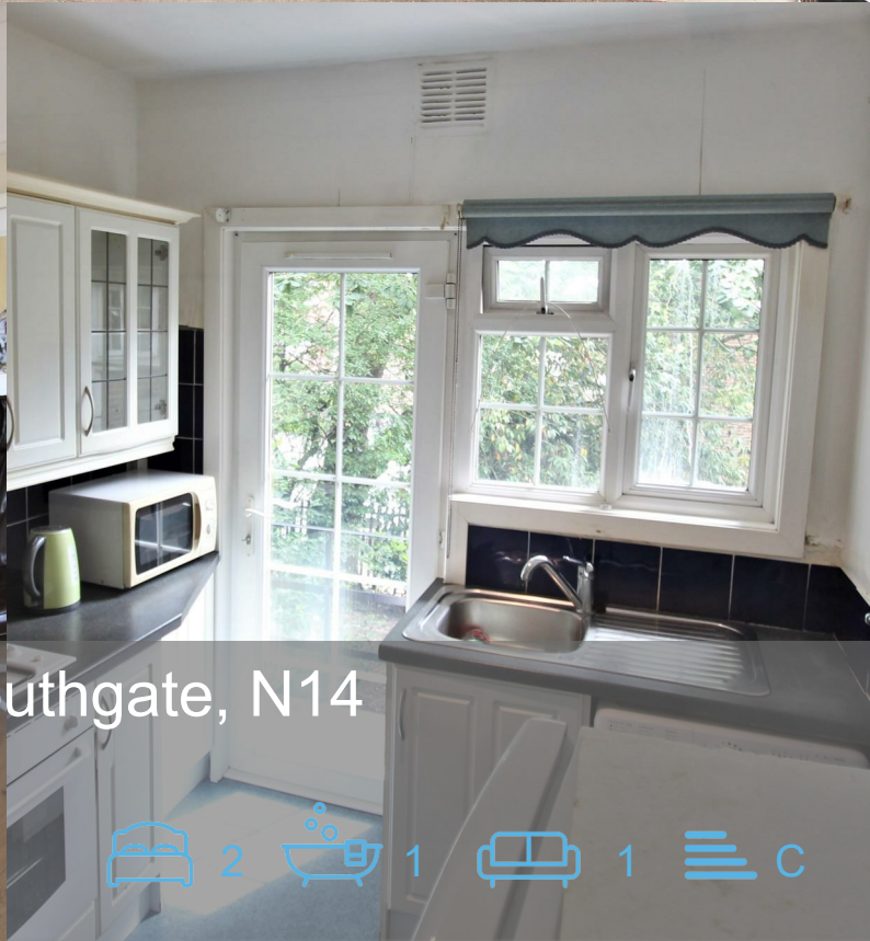
Bush Court, Crown Lane, Southgate, N14